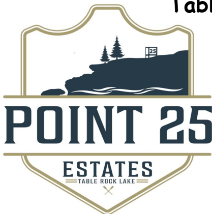
Table Rock Lake

Lakefront & Lakeview Lots Available with Boat Slip Option Kyle Bishop (Parishioner) 417-846-8715