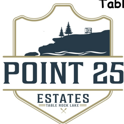
Table Rock Lake

Lakefront & Lakeview Lots Available with Boat Slip Option