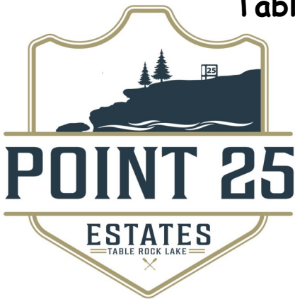
Table Rock Lake

Come Shop! St. Elizabeth Gift Shop Behind the Church Open 10:00-4:00 Thursday—Tuesday