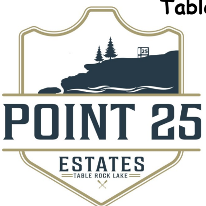
Table Rock Lake

Lakefront & Lakeview Lots Available with Boat Slip Option