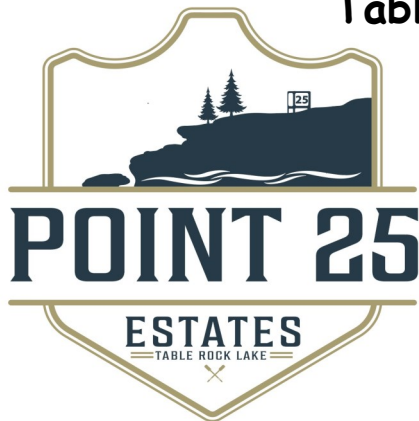
Table Rock Lake

Come Shop! St. Elizabeth Gift Shop Behind the Church Religious Gifts for the Entire Family Open 10:00-4:00 Thursday—Monday