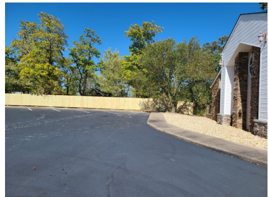
Thank Knights of Columbus for building our beautiful new fence.

The Taste of Faith dinner, held Aug. 6 in downtown Little Rock, raised $509,000 for seminarian education, surpassing its $400,000 goal. As previously reported, Sacred Heart of Jesus Church in Hot Springs Village raised $51,000 during its Knights of Columbus fundraiser in July, The diocese currently has 21 seminarians studying in Little Rock, San Antonio, Washington, D.C., and St. Meinrad, Ind.