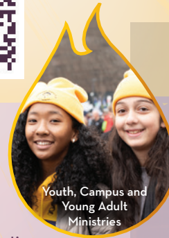
Youth, Campus and Young Adult Ministries

For more information, please call the Bishop's Lenten Appeal office at 703-841-2570 or visit our website at