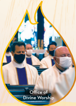
Office of Divine Worship