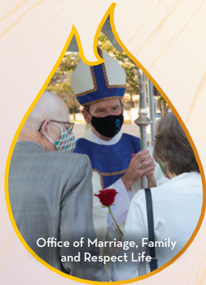
Office of Marriage, Family and Respect Life

For every dollar you donate above the gift amount you last donated to the BLA, the challenge gift will match up to $300,000. If you are donating for the first time to the BLA, your entire gift will be matched!