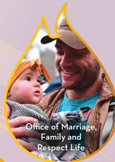
Office of Marriage, Family and Respect Life