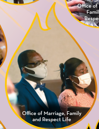
Office of Marriage, Family and Respect Life